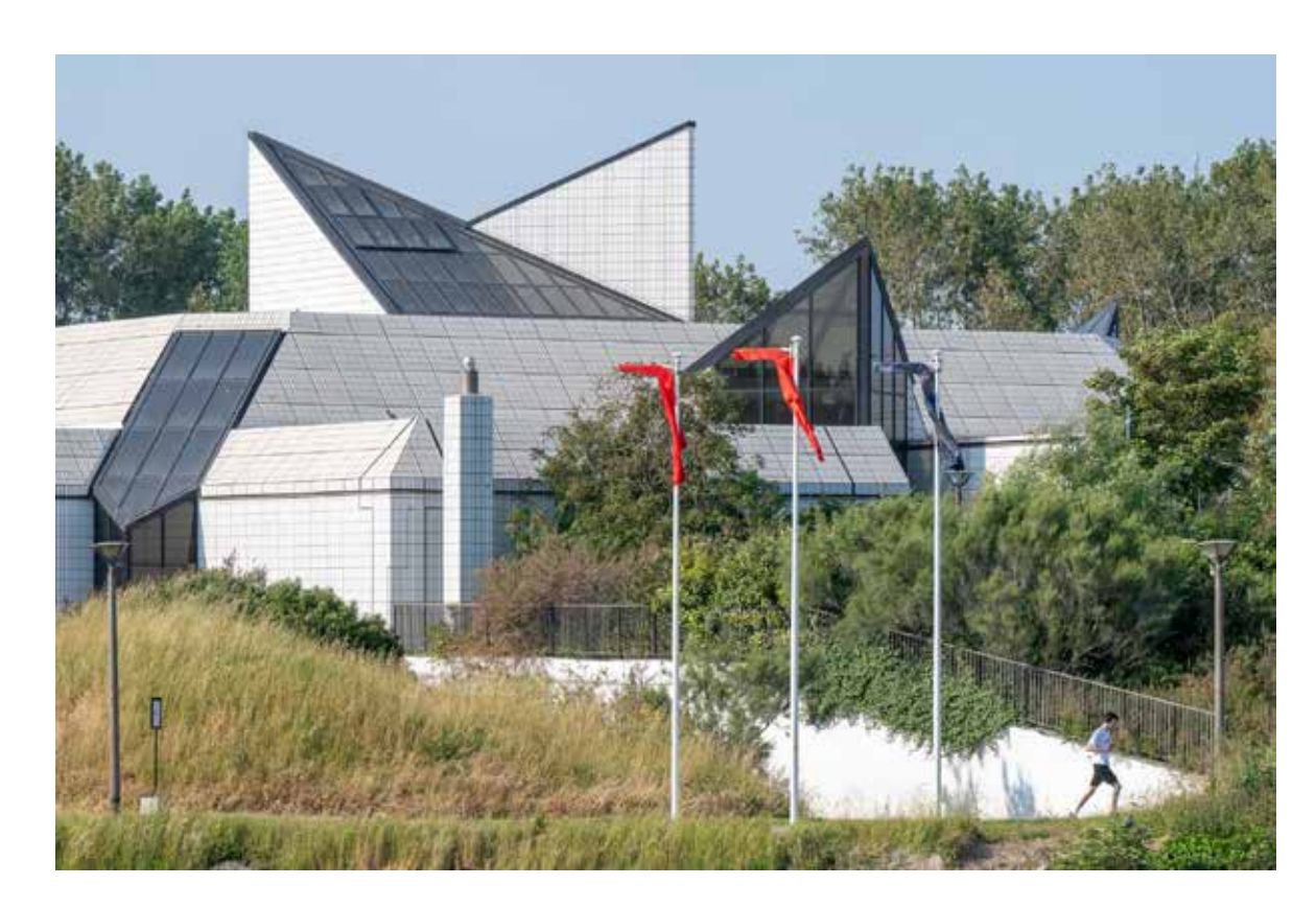
View of LAAC, Chaleur humaine, Triennale Art & Industrie, 2023.