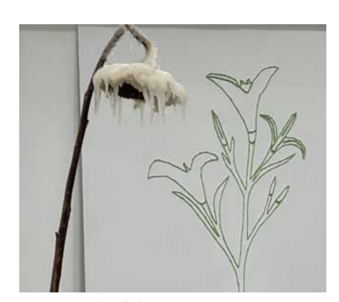
«Racine(s)», La Chapelle des Jésuites, Saint-Omer. Resonance Art & Industry Triennial.