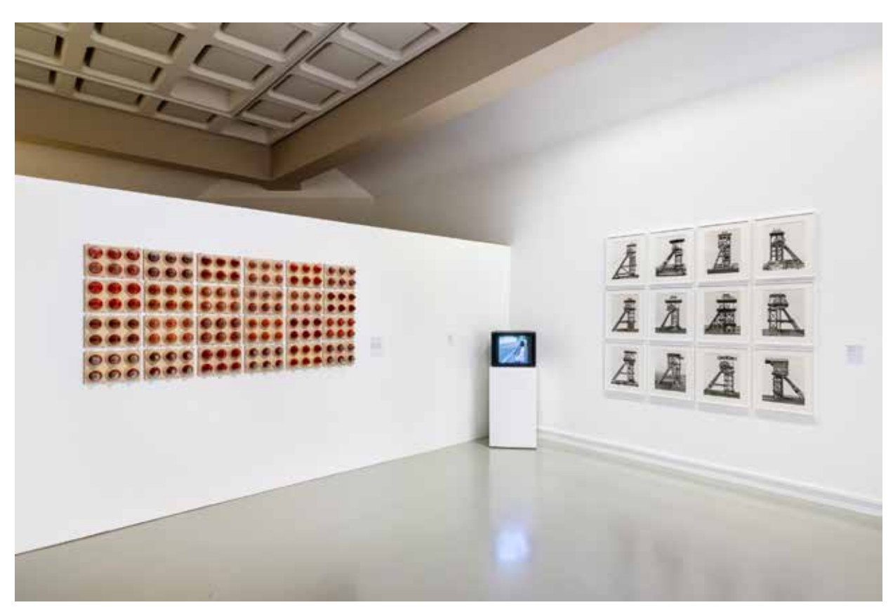
LAAC exhibition view, Human Heat, Art & Industry Triennial, 2023.