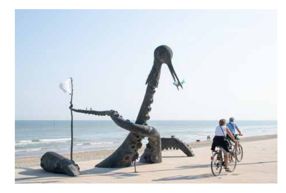
Laure Prouvost, Oui Will Become One Another, 2023. Commande publique de la Communauté Urbaine de Dunkerque.