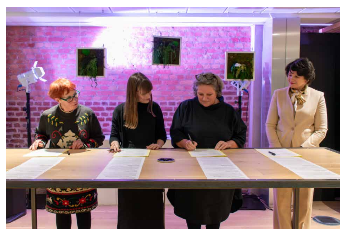
Signing of the Cooperation Charter for the Dunkirk, Beaufort, Bruges and Kortrijk Triennials.

This event was also an opportunity for the Triennales of Dunkirk, Beaufort, Bruges and Kortrijk to jointly draw up a Charter to share best practice and collectively develop tools to meet their desire to work towards a model that is more respectful of the living world and more sustainable. This charter also reinforces the joint cross-border cooperation strategy. It aims to promote and raise the profile of a cross-border cultural area outside its territory, both among cultural professionals and the general public, and to develop a structuring and sustainable framework for these cross-border cultural exchanges.