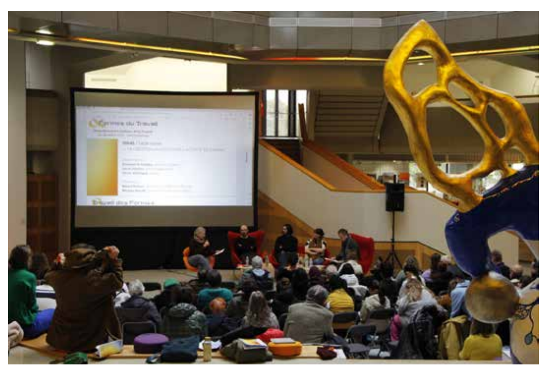
5th National Meeting on Culture; Arts/Labour at LAAC Dunkerque «Travail des formes et formes du travail» (Work on forms and forms of work)