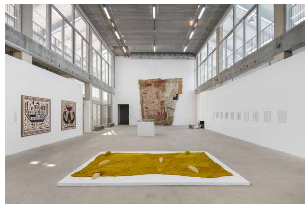
View of exhibition at Frac Grand Large, Chaleur humaine, Triennale Art & Industrie, 2023.