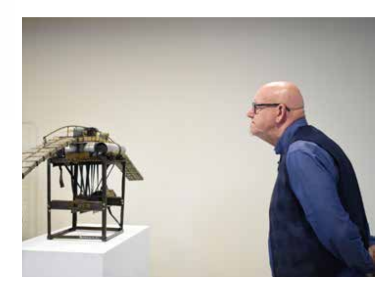
View of exhibition at Socx Town Hall, Embarquement immédiat, Résonance de la Triennale Art & Industrie.