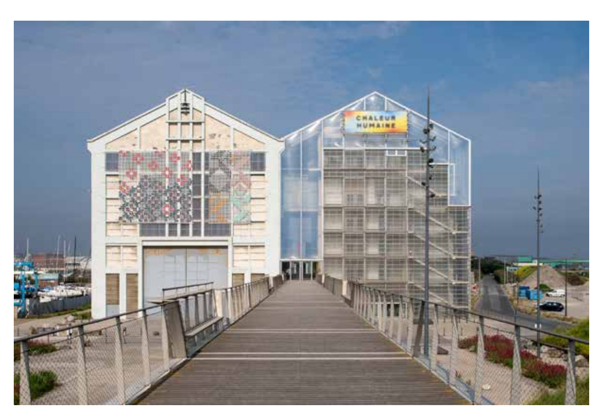
\label{thm:conditional} \begin{tabular}{ll} Wiew of the Frac Grand Large and Halle AP2, Chaleur humaine, Triennale Art \& Industrie, 2023. \\ \end{tabular}