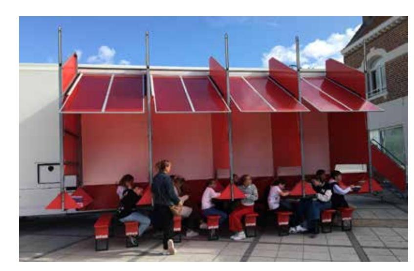
Le MuMo in Vitry-en-Artois. Résonance Resonance Art & Industry Triennial.