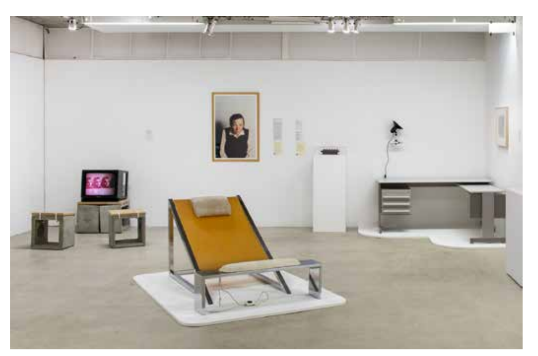
View of exhibition at Frac Grand Large, Chaleur humaine, Triennale Art & Industrie, 2023.

The works were displayed in the exhibition spaces of the Frac Grand Large - Hauts-de-France, the LAAC, musée de France, the city of Dunkirk, the industrial wasteland of Halle AP2 and in the public space. They have witnessed and reflected energy events from 1972 to the present day and their various impacts, whether positive, negative or neutral, on humanity and the living world, on behaviour and emotions, and on the present and future. For this second edition, the Frac and the LAAC have drawn on the partnerships forged with the Musée national d'art Moderne - Centre Pompidou and the Centre national des arts plastiques (CNAP), two national public institutions that have opened up their exceptional collections to them. Five Fracs have also joined in the adventure with exceptional loans, in addition to loans from artists and private collections.