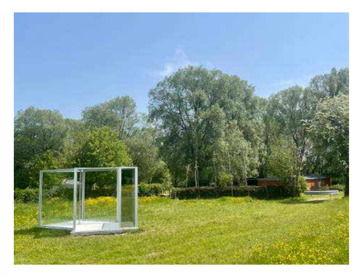
Dan Graham, Two Cubes, One Rotated 45°, 1986, Metal frames, glass, mirror, 225 \times 420 \times 300 cm. Resonance exhibition Eclectic Campagne(s) - Rêver, entre utopies et dystopies, at La chambre d'eau, Le Favril.