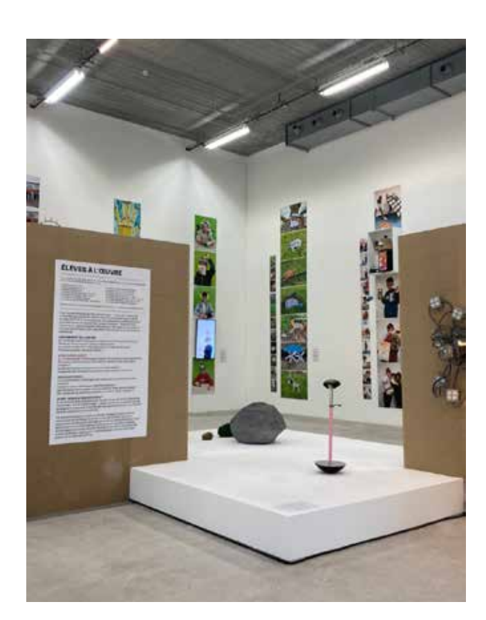
Exhibition view - Restitution Élèves à l'œuvre 2023

13 projects in schools including loans of works from the Frac Grand Large